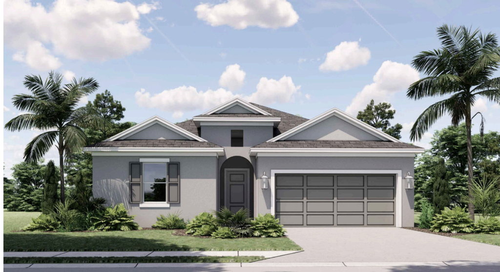
ELEVATION A TRADITIONAL