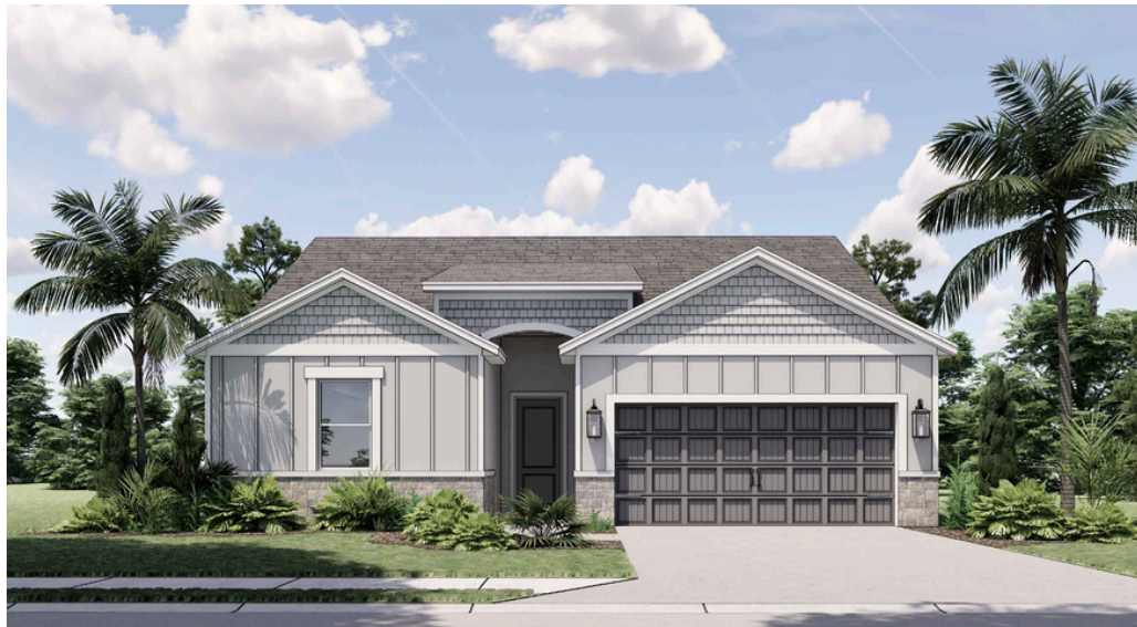
ELEVATION B CRAFTSMAN