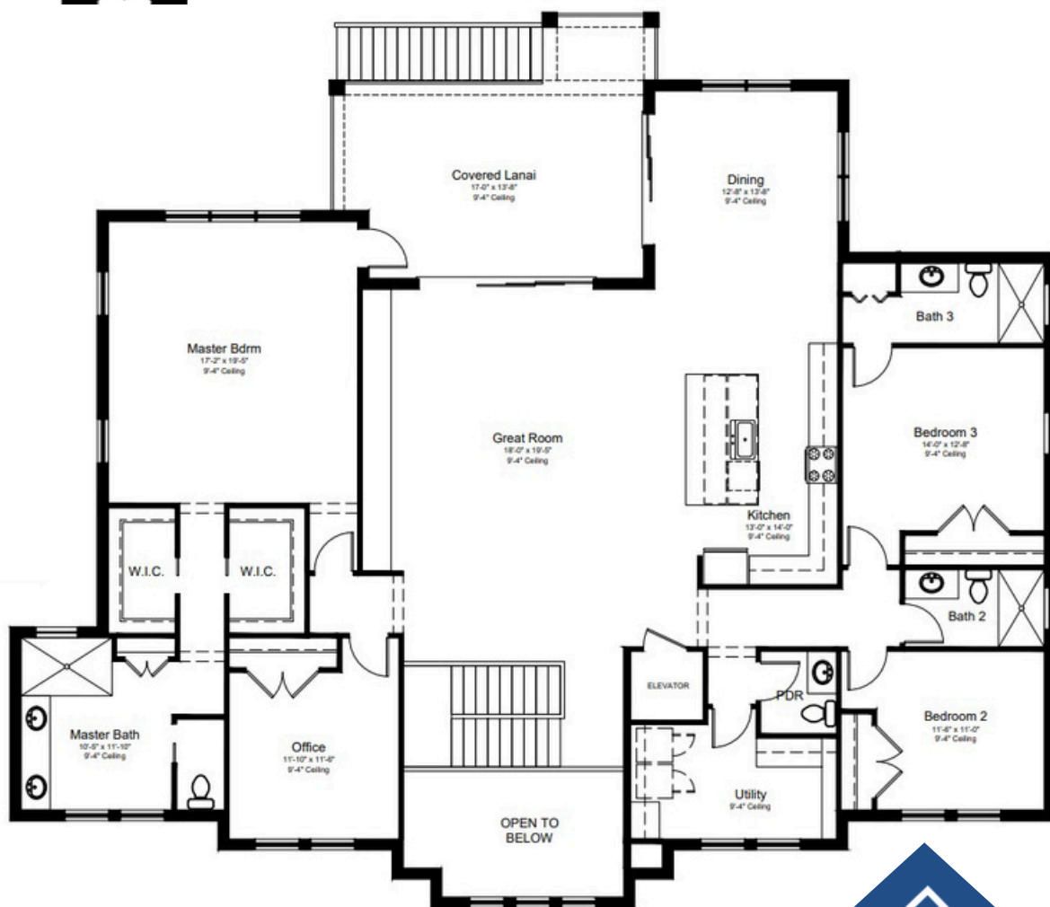
ENTRY LEVEL FLOORPLAN