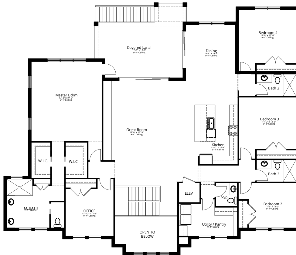
MAIN LEVEL FLOORPLAN

3,323 SF 3 BED/2.5 BATH/OFFICE/ 2-CAR GARAGE