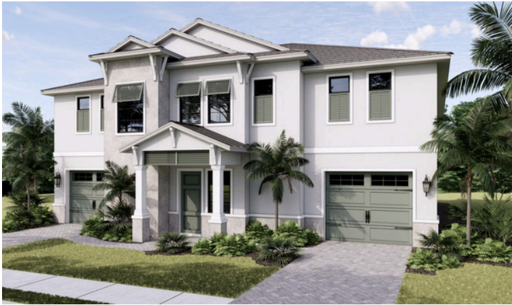
BRITISH WEST INDIES