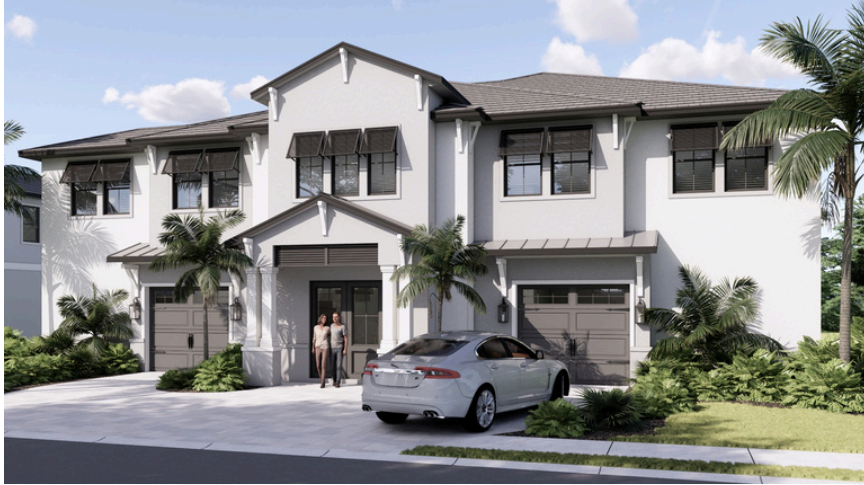
BRITISH WEST INDIES