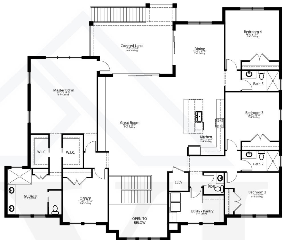
MAIN LEVEL FLOORPLAN