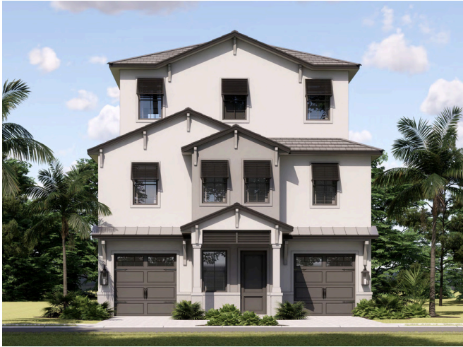
BRITISH WEST INDIES