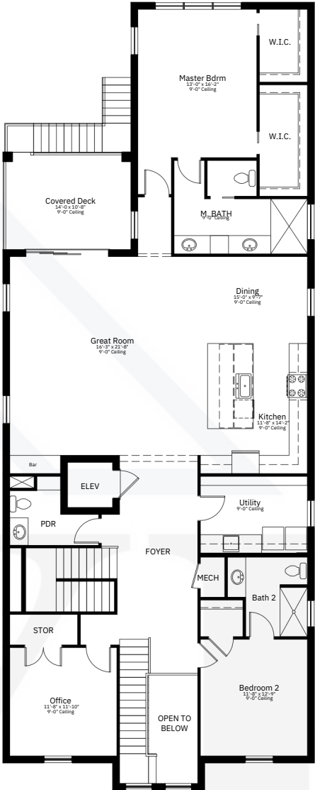
MAIN LEVEL FLOORPLAN