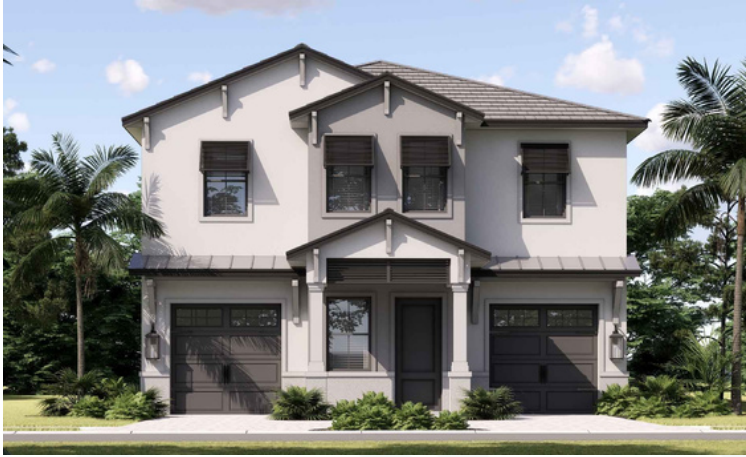
BRITISH WEST INDIES